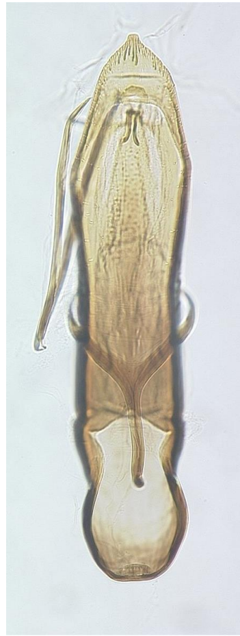
d Epitrix tuberis