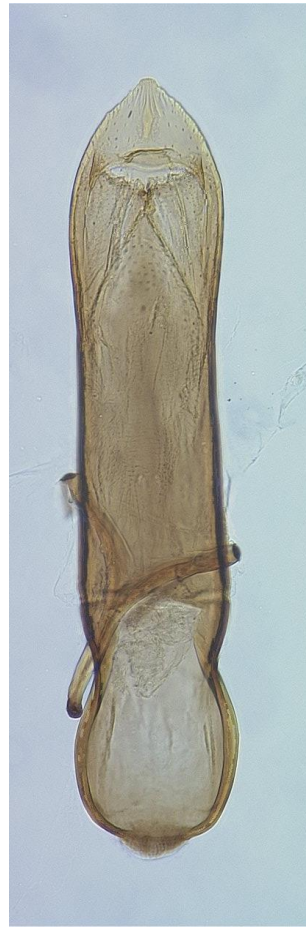
b Epitrix papa