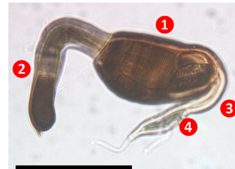
d Epitrix tuberis

1 receptacle 2 pump 3 spermathecal ductus 4 gland valve