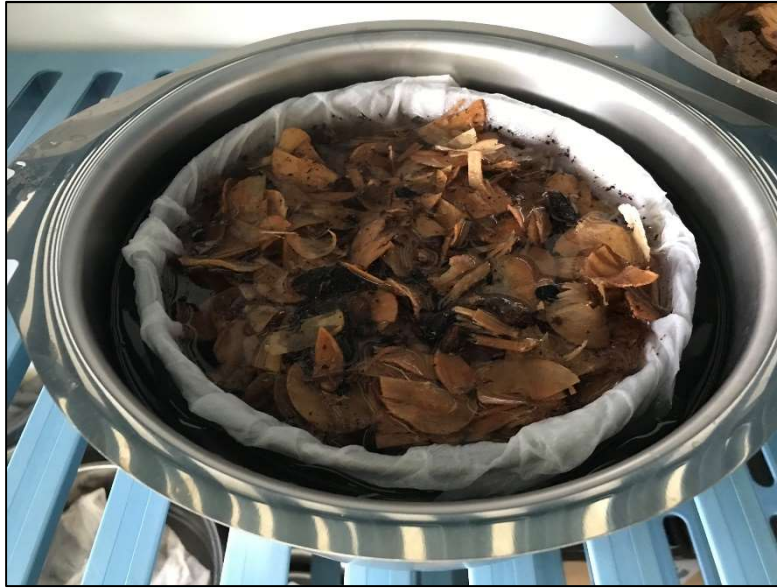
Figure 1 –Extraction of B. xylophilus from bark using the Oostenbrink dish.