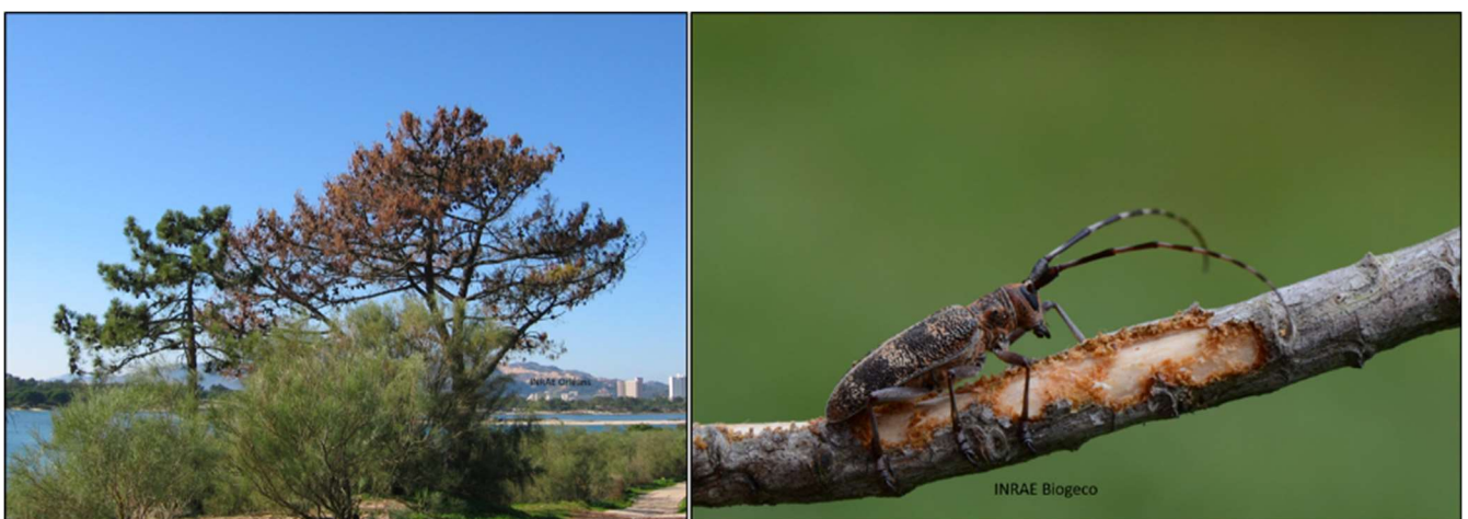
Figure 1 – Symptoms of Pine wilt disease on Pinus caused by Bursaphelenchus xylophilus (A), and adult insect of Monochamus spp., vector of B. xylophilus (B).

Next to their occurrence in vector insects ( Monochamus spp.), B. xylophilus can be present in several coniferous products: wood, wood products and packaging, wood chips/shavings, plants for planting, branches, isolated bark, but not in needles, cones or seeds. Therefore, samples of imported wood and standing conifer trees should be taken and verified for the presence of the nematode.