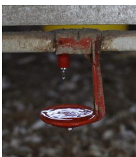
Nipple leaking can compromise litter quality